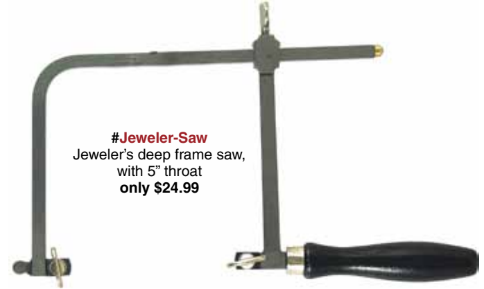
#Jeweler-Saw Jeweler's deep frame saw, with 5" throat only $24.99

Beeswax, lubricant for Jeweler's saw blades .....#Beeswax Lubricant for Jeweler's saw blades. One ounce stick, pure beeswax. #Beeswax beeswax stick for lubricating only $4.50