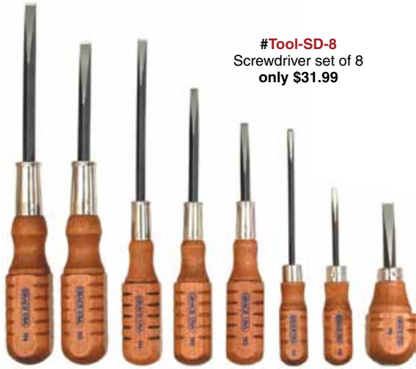
#Tool-SD-8 Screwdriver set of 8 only $31.99

Gun Care 8 piece Screwdriver Set..... #Tool-SD-8 Grace USA's top quality gun care screwdriver set. Comes with eight screwdrivers, custom hollow-ground. The square-shanked blades are hardened and tempered to Rc 52-56, in the U.S.A. #Tool-SD-8 8 piece screwdriver set only $31.99