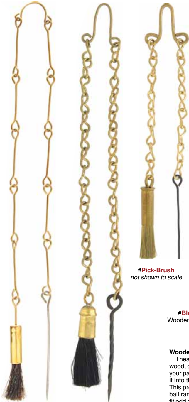
#Pick-Brush not shown to scale

#Pick-Nipple bone handle, steel wire $1.99