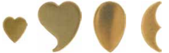
#In-Heart-1 #In-Heart-2 #In-TD #In-Moon-3