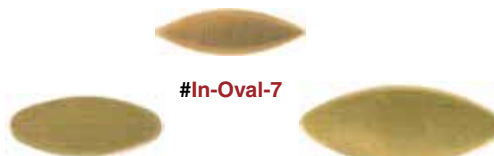
#In-Oval-1 #In-Oval-2 #In-Oval-7