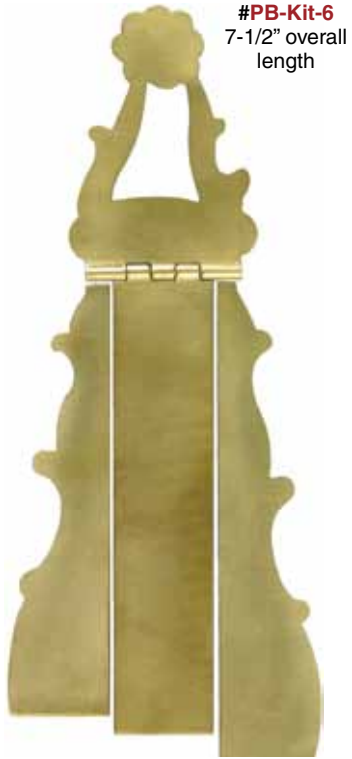
#PB-Kit-6 7-1/2" overall length