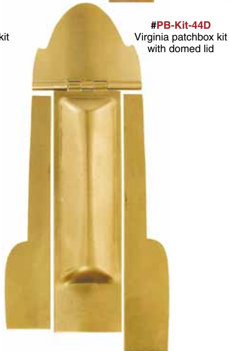
#PB-Kit-44D Virginia patchbox kit with domed lid