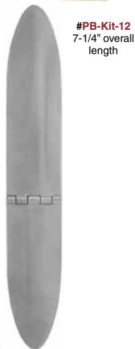
#PB-Kit-12 7-1/4" overall length