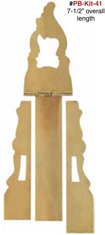
#PB-Kit-41 7-1/2" overall length