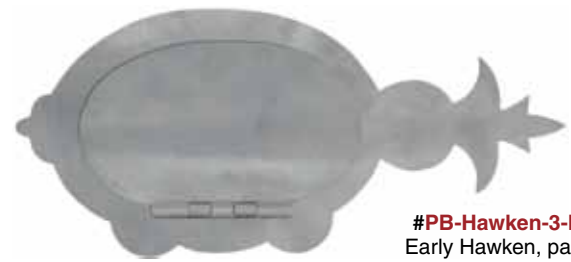
#PB-Hawken-3-B, I, or S Early Hawken, patchbox kit