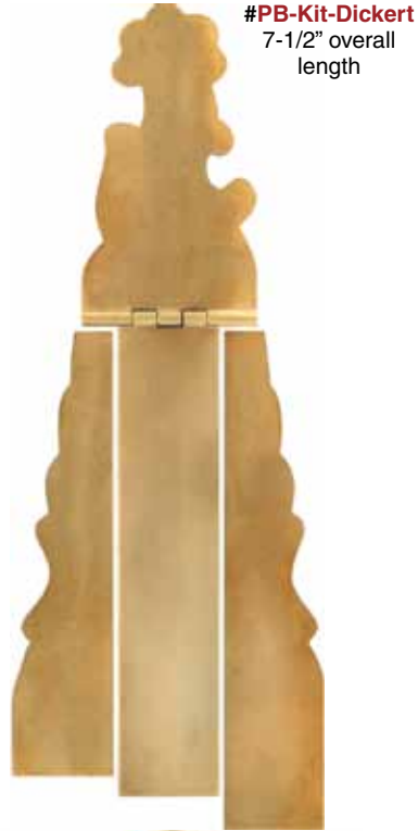
#PB-Kit-Dickert 7-1/2" overall length