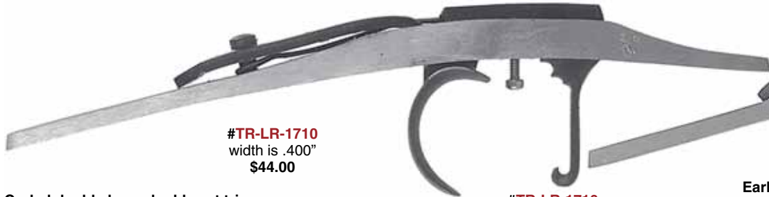
#TR-LR-1710 width is .400" $44.00