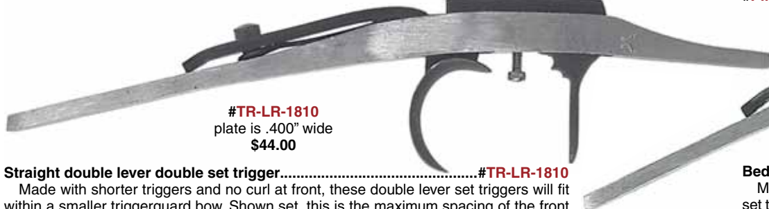
#TR-LR-1810 plate is .400" wide $44.00