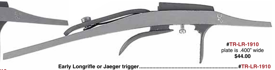
#TR-LR-1910 plate is .400" wide $44.00