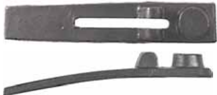
#TR-G-36-P trigger plate $13.99

#TR-IH-T trigger only, wax cast steel only $ 7.99 #TR-IH-P trigger plate only, slotted only $10.99