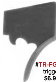
#TR-FG-1-T trigger $6.99