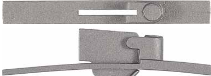
#TR-IH-P trigger plate $10.99 #TR-IH-T trigger $7.99