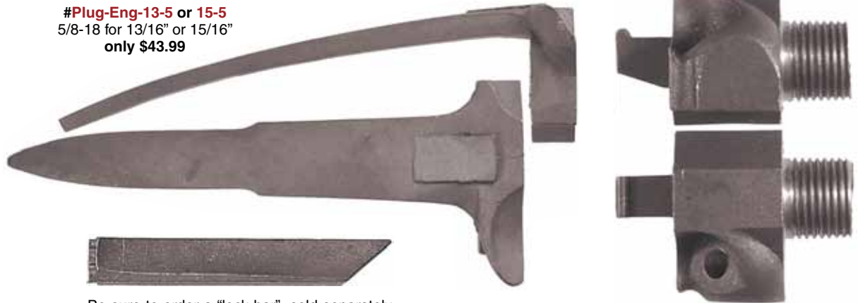
#Plug-Eng-13-5 or 15-5 5/8-18 for 13/16” or 15/16” only $43.99

Be sure to order a “lock bar”, sold separately. Mount it to your barrel with solder, ahead of any square bolster English style breech plug.