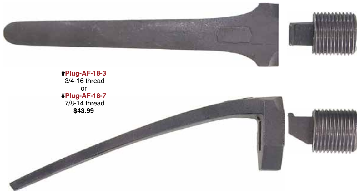
#Plug-AF-18-3 3/4-16 thread or #Plug-AF-18-7 7/8-14 thread $43.99