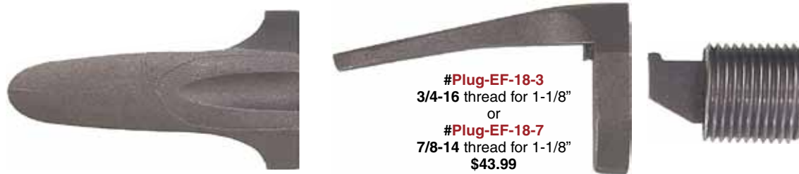
#Plug-EF-18-3 3/4-16 thread for 1-1/8" or #Plug-EF-18-7 7/8-14 thread for 1-1/8" $43.99