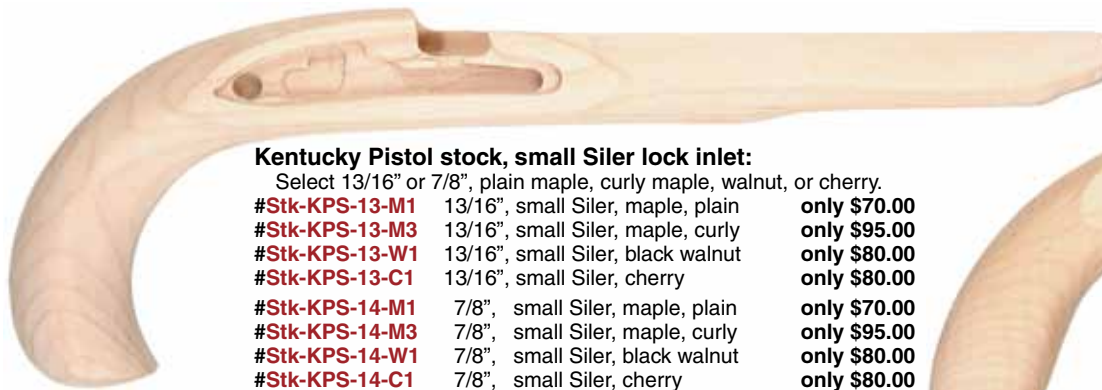
Kentucky Pistol stock with lock mortise