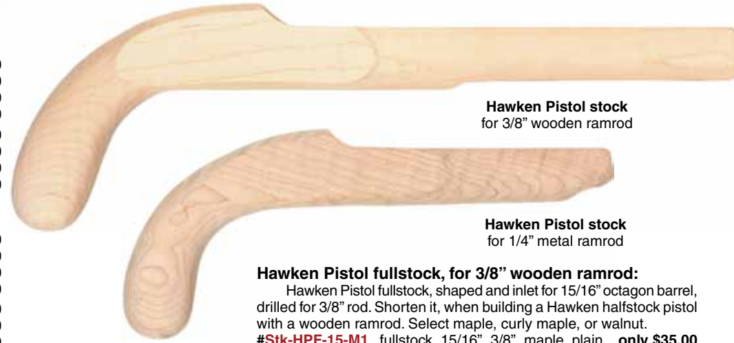
Hawken Pistol stock for 3/8" wooden ramrod