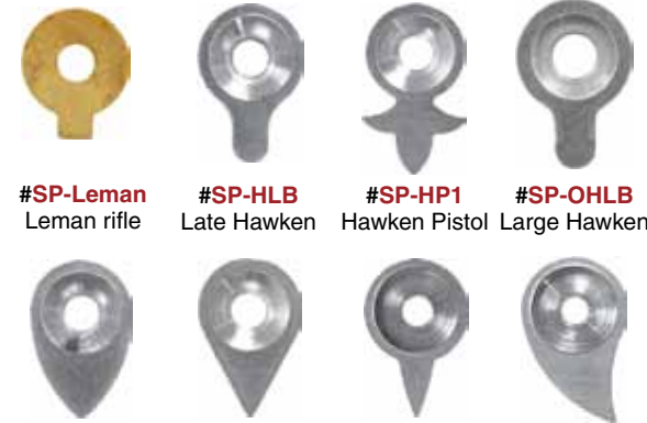
#SP-Leman Leman rifle

#SP-Wing-I sideplate, winged, iron only $5.99