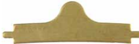
#SP-Vincent-B or S