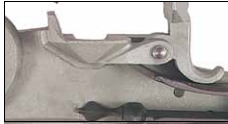
#Lock-LR-2100 Classic flint lock with pan bridle, right only $133.00

#Lock-LR-2175 Classic flint lock, pan bridle, left only $133.00