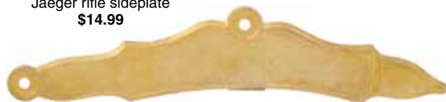
#SP-Jaeg-2-B Jaeger rifle sideplate $14.99