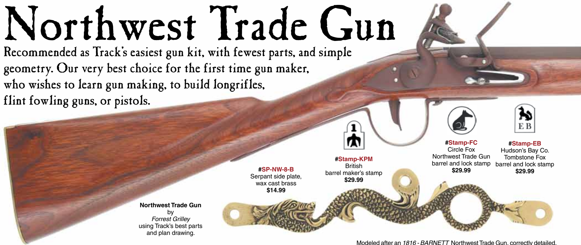
Northwest Trade Gun by Forrest Grilley using Track's best parts and plan drawing.

Recommended as Track's easiest gun kit, with fewest parts, and simple geometry. Our very best choice for the first time gun maker, who wishes to learn gun making, to build longrifles, flint fowling guns, or pistols.