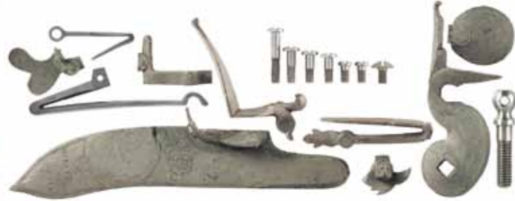
#Lock-Bess-46 1746 Brown Bess lock kit castings, with screws $134.99