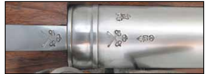
Add period markings to the breech, tang, and stock of your Bess, using replica stamps from our web site, to add to an historic feel.