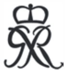
#Stamp-GR-SKM Ordnance storekeeper's stock stamp $29.99