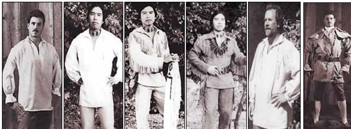
#Pattern-64 Authentic American Shirt $8.99