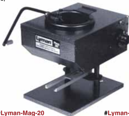
#Lyman-Mag-20 electric pot with valve $345.99