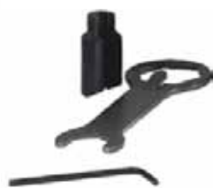
#Lyman-Luber bullet luber sizer press, no heater only $175.99