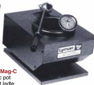
#Lyman-Mag-C electric pot for bullet ladle $275.99