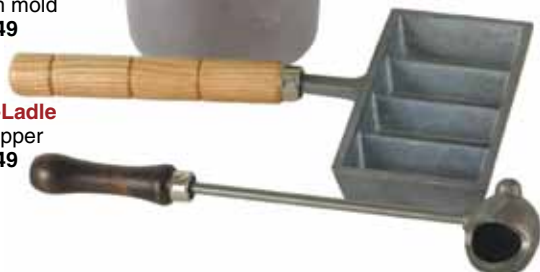
#Lyman-Ladle bullet dipper $20.49