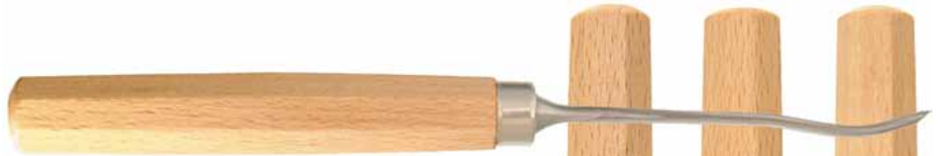
#Chisel-75-8-B 8mm wide round curved short