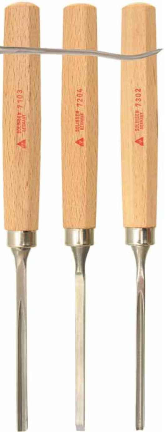
#Chisel-7103 3 mm wide "V" gouge

#Chisel-Set-8 chisels, selected set of eight only $169.99