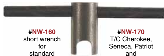
#NW-160 short wrench for standard rifle & shotgun nipples $6.99

Nipple Wrench, for Military Musket ..... #NW-100 Stronger than other musket wrenches, use this wrench for heavy duty jobs. Any wrench can be broken! Loosen rusted nipples with penetrating oil or heat. Is the barrel loaded? This .255" slot fits 1/4" Springfield, Enfield, and other musket nipples. Made in U.S.A. #NW-100 musket wrench, oval only $6.99