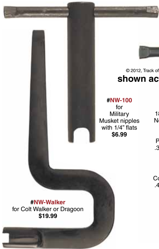
#NW-100 for Military Musket nipples with 1/4" flats $6.99