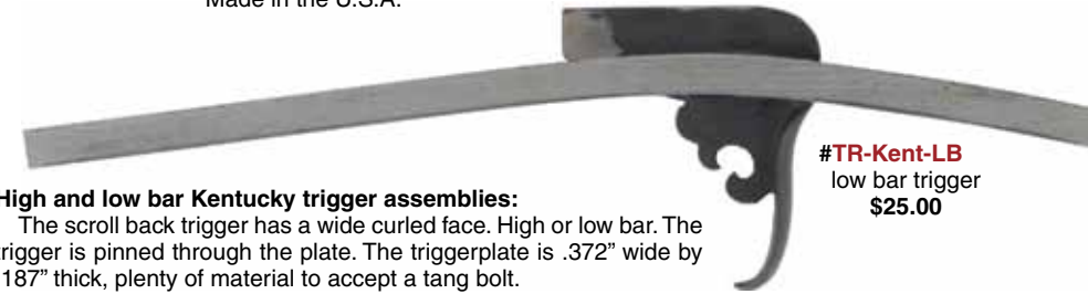
#TR-Kent-LB low bar trigger $25.00