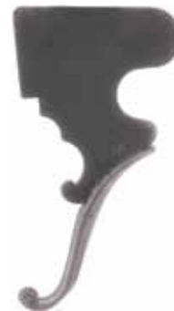
#TR-Fowl-MH-T trigger $6.99