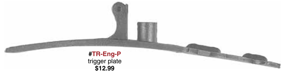
#TR-Eng-P trigger plate $12.99