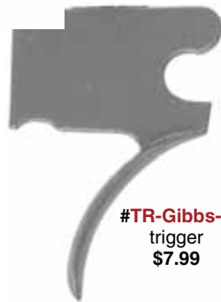
#TR-Gibbs-T trigger $7.99