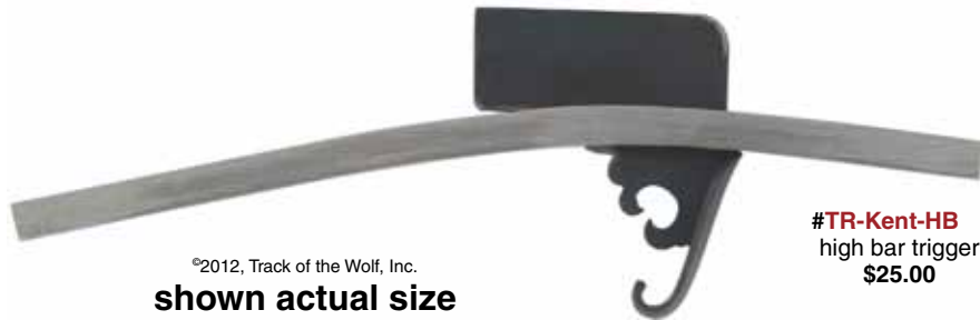
#TR-Kent-HB high bar trigger $25.00