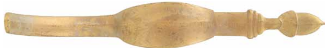
Triggerguard, wax cast brass or steel .....#TG-P1-B or I A flint pistol triggerguard with acorn front finial, a popular English motif. #TG-P1-B triggerguard, wax cast brass only $33.99 #TG-P1-I triggerguard, wax cast steel only $18.99