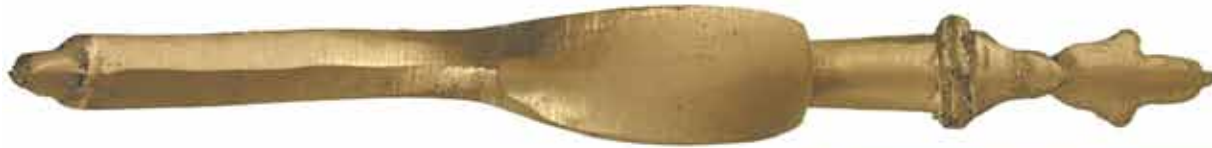
Triggerguard, sand cast brass, only .....#TG-MA-120-B The front finial of this Kentucky Pistol guard is an English acorn, styled to the primitive folk-art whimsy of the American pistol maker. #TG-MA-120-B triggerguard, sand cast brass only $10.50