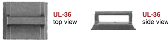
UL-36 top view UL-36 side view

#UL-DH-2B underlug, dovetail, milled brass only $1.99