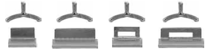
UL-TC-S1 UL-TC-S2 UL-TC-S3 UL-TC-S4