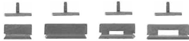
UL-NW-1 UL-NW-4 UL-NW-2 UL-NW-3