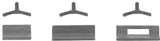
UL-NW-S1 UL-NW-S2 UL-NW-S3

#UL-NW-3 underlug, slotted, milled only $2.50