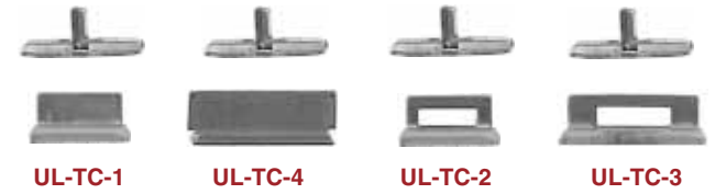
UL-TC-1 UL-TC-4 UL-TC-2 UL-TC-3

#UL-SPW-3 strip of 3 underlugs, sand cast brass only $2.99