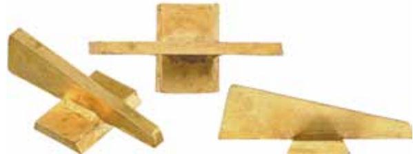
Angled View Top View Side View