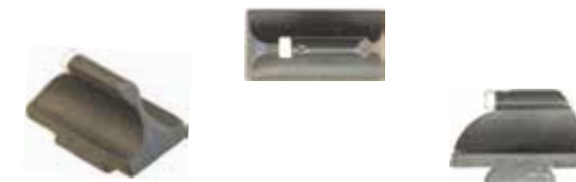
Angled View Top View Side View