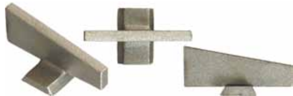
Angled View Top View Side View