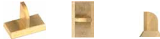
Angled View Top View Side View