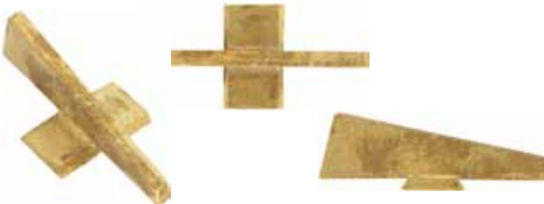
Angled View Top View Side View