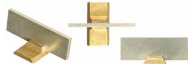
Angled View Top View Side View