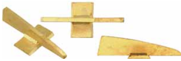
Angled View Top View Side View