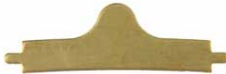
#SP-Vincent-B Vincent sideplate, brass $2.59