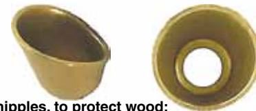
#Flash-Cup-2 fits under nipple brass $2.99