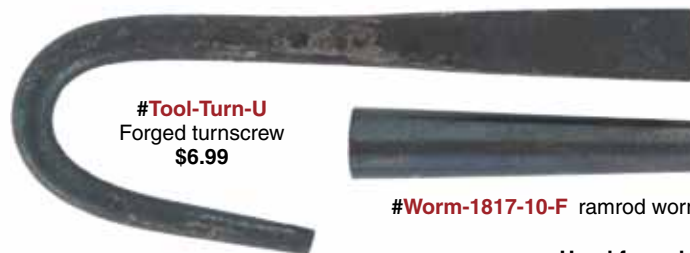
#Worm-1817-10-F ramrod worm $8.99