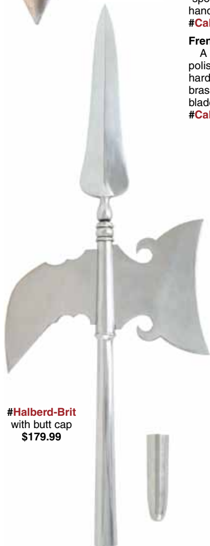
#Halberd-Brit with butt cap $179.99

#Calumet-FR French Chippewa Calumet only $36.99